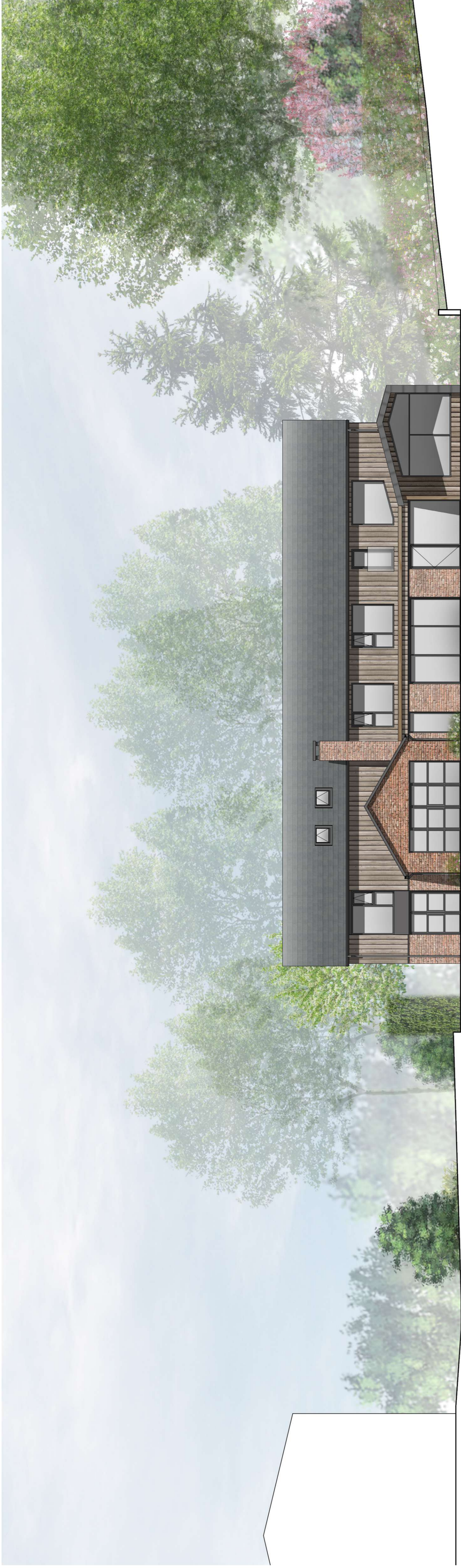
Proposed South Elevation 1 : 100