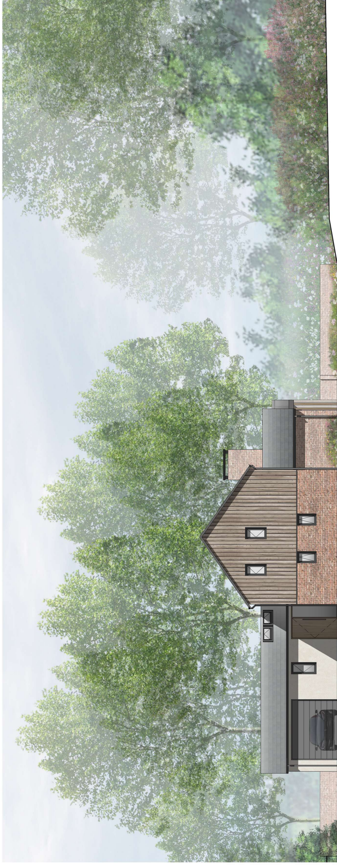
Proposed West Elevation 1 : 100

P2 Drawing adjusted 03.02.22 P1 Planning Issue 10.11.21